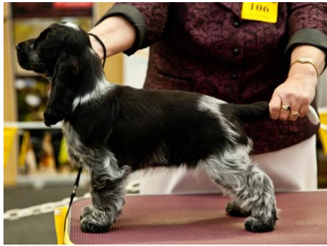
2. - Candlewind Foreign Affair Fitzgerald & Oakley

Dark blue very baby puppy little short of four months. She is square of body with good rear angulation, correct length and angle of upper arm which equates to correct lay of shoulders. Pleasing head coat coming along quite nicely. Moved soundly.