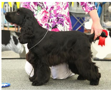
1. Maleanda Little Tin Man

Notes say that 2 very likeable puppies with not much to separate, photos bear this out. Class winner more positive and far reaching on the move. Both pleasing in outline with lovely heads. Nicely ribbed and well off for bone, super tight feet, one of my "likes". Coat on blacks need patience, where if the desire to rip it out can be resisted the results are enviable. These ladies understand.