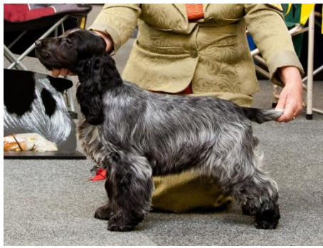
2. - Bolwarra Monkey Face. G&M Markotany

Notes say, lovely blue, so very sound, big ribbed, possesses lovely head. Neat feet, well off for bone. Says it all, photo confirms.