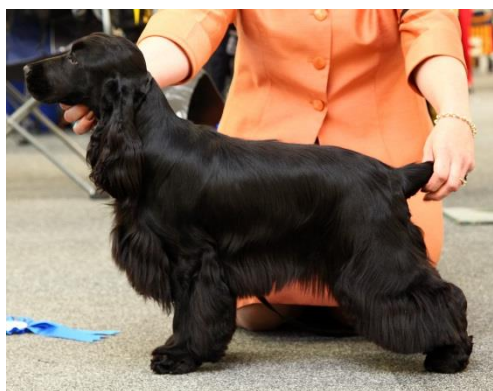
1. - Elspan Sea Shanty.