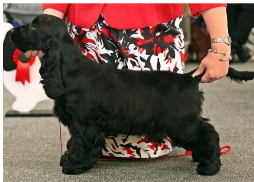
2. Pencandy Man in Black. N&T Crocker

Pleasing headed golden dog, cobby in shape with good layback of shoulder, lovely top line which he kept whilst on the move. Presentation correct for age and coat colour.