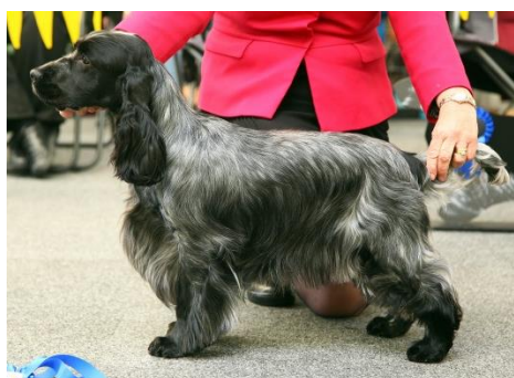
1. -Ch Doulton Fascination. Jones & Job Lovely headed cobby blue bitch, Correct angle and length of upper arm equates to the smooth lay of shoulder. Great front, big ribbed yet elegant in style. Moved with confidence, great level of presentation.

3 lovely blue bitches headed this quality class. My notes say that similar comments apply and the photos bear this out.