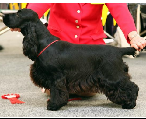
2. - Manungo Sno Easy

Super black bitch with the loveliest of heads, dark eye and gentle expression. Excellent front with plenty of heart room, smooth lay of shoulder, excellent spring of rib, short coupled, all contained within a gleaming black jacket. Sound happy mover who should have a very bright future.