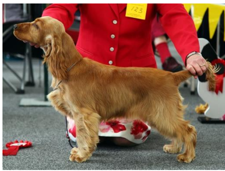
2. - Manunga More Bang for Ya Bux S&M Sticher

8 month old black bitch with an exquisite head, darkest of eyes. Well developed front, really excels in the forehand. Rear angles correct, short below the hock and moves with attitude. Must have a bright future.