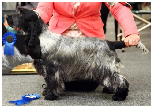
1. - Ryangaye Reason T Sing.