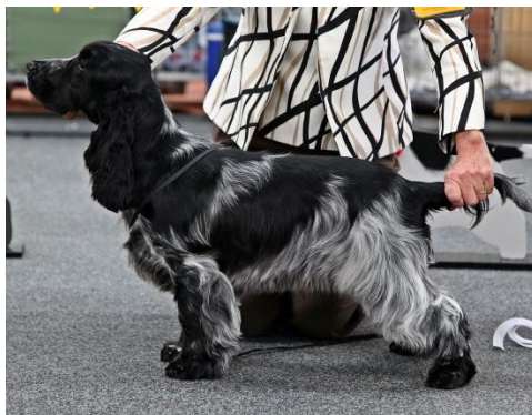
2. Royoni Watch This Star

Dark blue puppy eye catching in outline, big ribbed good angulation well off for bone even at 6 months of age. Pleasing head with dark eyes. Presentation first class, moved with confidence.