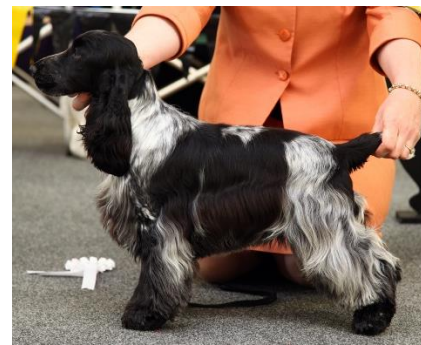
3. - Espan Last Dance.

Dark blue build on finer lines than class winner. Really pleasing head with correct angulations fore and aft. Moved well.