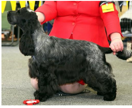
2. - Watersmeet American Gigolo L Emerton

16 month old dark blue that oozes quality throughout. Lovely in out line, presentation an object lesson. One of the nicest blue heads thus far with dark eye and gentle expression. Clean throat, excelled in the forehand, well off for bone and very sound on the move maintaining a level top line. Handled to advantage