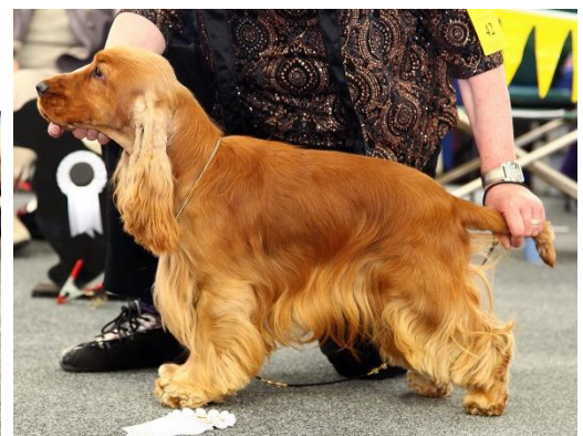
3. - Jayped Nononesensfromme D Thomas

Black of quality, built on bigger lines that class winner but many comments apply. Show in full coat in lovely condition. Moved with confidence and was sympathetically handed.