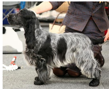
3. Braycharm the Flag Bearer

Dark blue build on bigger lines and not as well bodied as class winner, none the less promising youngster. Pleasing head and very sound and confident on the move.