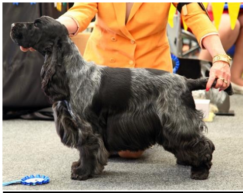
1. - Ch Bencleuth Beaujolais (UK) A C O'Keeke

The dog who's progeny featured so well in this show headed this excellent class. My brief notes say, top quality dark blue, square shape, short coupled, lovely head, excellent neck and shoulders, neat feet, good bone. Excellent presentation, well handled. Looking at the photograph that says it all. At 4 years of age is at his best.