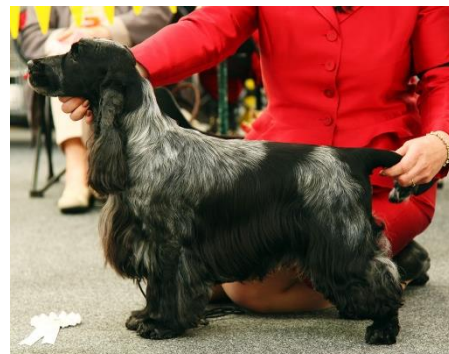
3. - Gr Ch Cobalt Headliner Fitsgeralds&Oakley

Another dark blue of similar type wit many of the comments as to class winner applying. Excellent forehand and level topline.