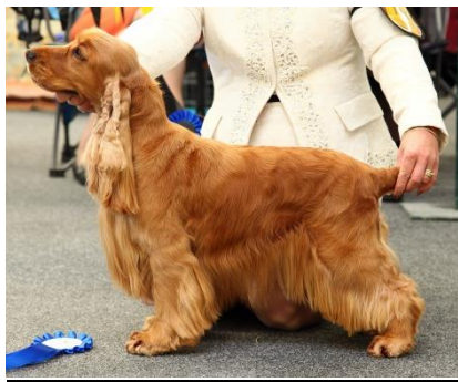
1. -Nz Ch Ashard Amour D'Anglaise (NZ) T Dennis

6 Champions in contention in this class of mature bitches.