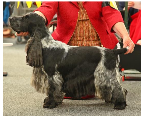
3. - Sup Ch Bolwarra Riptide G&M Markontany

Slightly longer in body than class winner but another very smart dark blue. Pleasing head, good lay of shoulder, maintained a level topline whilst on the move. Well presented.