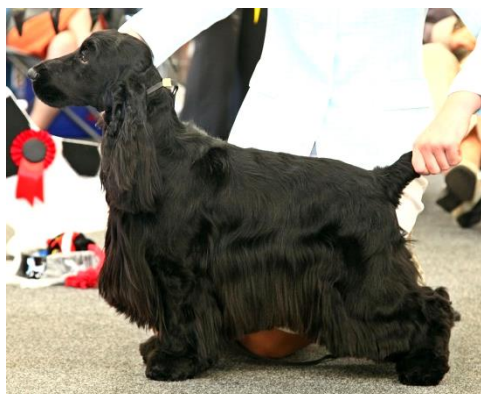
2. - Ashard Heir to The Dark Knight T Dennis

1. - Elspan Surfside Casbolt & Petrowsky Black dog of good type with lots to like. Pleasing head and dark eye, good lay of shoulder strong body with correct angulations. Short below the hock which allowed him to power forward. Coat at that in between stage. Handled with confidence.