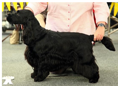
3 - Kalleo Hearts N Bones. C McLennan

Black dog of good type but not the quality or finish of class winner, none the less much to like. Lovely head and expression, short coupled and moved well.