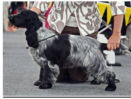
3. - Royoni Keep Watching Me. Royoni Kennel

A monkey face she has not! Smart dark blue with pleasing head, dark eye and lovely expression. Slightly longer in back than class winner with good bone tightest of feet. Moved well coat coming along as it should.