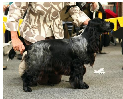
3. - Royoni Watch Your Step. Royoni Kennel Unfortunate to be up against such lovely youngsters, she did not have the substance or compact body. A grand little bitch who moved well.