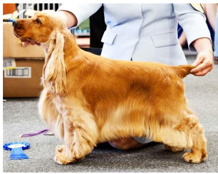
1. - Am Ch Dawnglow it Shouldn't be Legal (USA) Dennis&La Flamme (Best Intermediate in Show)

The first thing you notice about this quality golden is his wonderful golden jacket, presentation an object lesson. Gorgeous head, dark eye and melting expression. Excellent front and lay of shoulder, big ribbed, well muscled quarters helping him to power round the ring keeping a level topline. Super handling. Loved him.