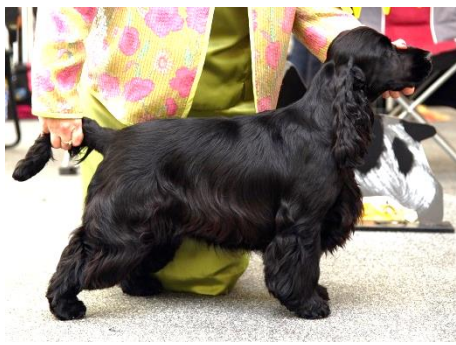
1. - Britebay Cassandra Britebay Kennel