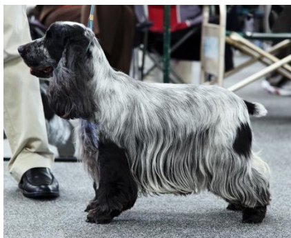
1. Sup Ch Bolwarra Hat Trick- S&M Sticher (Opposite Veteran in Show)

Stood alone but at some 8 years of age this light blue still commands attention. Short and compact with big ribs, firm body and width of quarters. Moved well for a bitch of any age! Lovely coat.