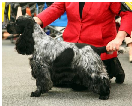
2. - Glenbriar Electric Blue S M McFadden

Another dark blue of similar type wit many of the comments as to class winner applying. Excellent forehand and level topline.