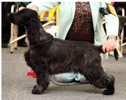
2. - Quinks Sweetest Moments.

Light blue of lovely type, boxy shape, exquisite head, nice tight eyes. Angles are all there, well off for bone. Solid little body, short coupled and sound on the move.