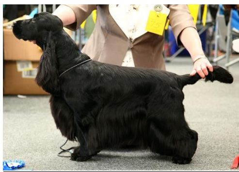
1. - Gr Ch Manunga Musketeer S&M Sticher (Dog CC), Opposite to BIS, Opposite Australian Bred in Show)

Surprising to read that this lovely blue is almost 7 years of age what a credit to his owner. He still maintains a strong level topline whilst on the move, perhaps lacking in furnishings. Lovely head, well off for bone well handled.