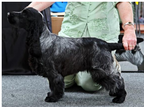
1. Sunlore Sparking Moet.

First class of strength in numbers and where progeny of the UK bred sire whose children were to garner major awards came to the fore.