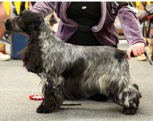
2. - Ch Ashmere Wyatt Earp. J Burbridge

The dog who's progeny featured so well in this show headed this excellent class. My brief notes say, top quality dark blue, square shape, short coupled, lovely head, excellent neck and shoulders, neat feet, good bone. Excellent presentation, well handled. Looking at the photograph that says it all. At 4 years of age is at his best.