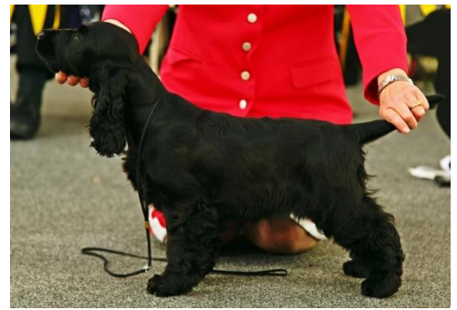
3. - Manunga Totally Qwackers. S&M Sticher

Not yet four months this little girl has the sweetest of heads with lovely expression. Stands on tight cat like feet, Cannot really comment with accuracy on one so immature, save to say she moved well.