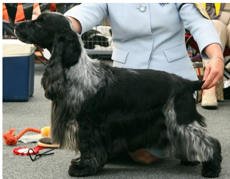
2. - Gr Ch Glenayden Melt Down.

Where do you start critiquing a dog of this quality with the head of course which is just classical. Dark eye, melting expression. It is a truism that a cocker spaniel is a dog without exaggeration, moderate in every respect. This is True Blue, square in shape, correct length and angle of upper arm clean shoulders, strong body with good spring of rib. Firm level topline maintained whilst on the move. Short coupled, short below the hock which allows for the desired bustling, driving action of the Breed Standard. Grand level of presentation, well handled. This dog could win in any Cocker orientated country me thinks.