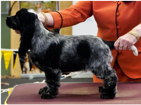
1. - Ballyoran River of Dreams A Byrne

Dark blue very baby puppy little short of four months. She is square of body with good rear angulation, correct length and angle of upper arm which equates to correct lay of shoulders. Pleasing head coat coming along quite nicely. Moved soundly.