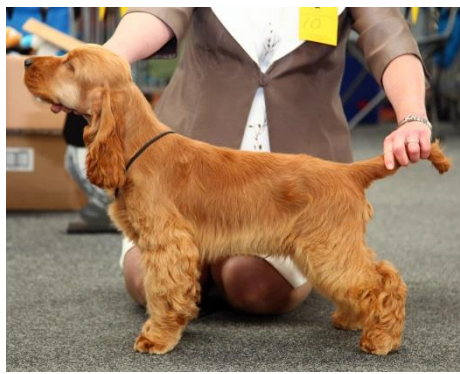
1. Manunga Flame N Fortune S&M Stitcher

Pleasing headed golden dog, cobby in shape with good layback of shoulder, lovely top line which he kept whilst on the move. Presentation correct for age and coat colour.