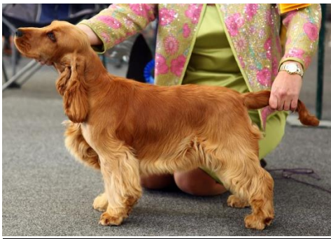
1. - Britebay All Fired up (AI) Britebay Kennel

(Opposite Minor Puppy in Show) Upstanding five and a half month old golden bitch. Lovely head, well off for bone with excellent front assembly. Hope she doesn't grow on too much. Moved well.