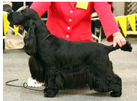
3. -Ch Manunga Make it Snappy S&M Sticher

Mature, quality black bitch. Solid construction. Lovely headed bitch, clean throat, good front. Maintained firm topline whilst moving. Lovely level of presentation.