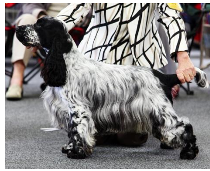
3. - Ch Lindridge I've Arrived (UK) Royoni Kennel

Many of the comments as to class winner apply to this dark blue. Preferred the head of class winner. Sound on the move, well presented.