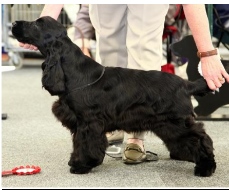
2. Mistduke First Chance.