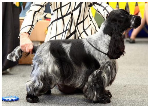
1. - Royoni Victory in Blue Royoni Kennel

This 18month old dark blue won on his overall balance and soundness. Lovely chiselled head, dark eye and melting expression. Clean neck and shoulders, big ribbed, short below the hock with lends to positive powering action. Well handled.