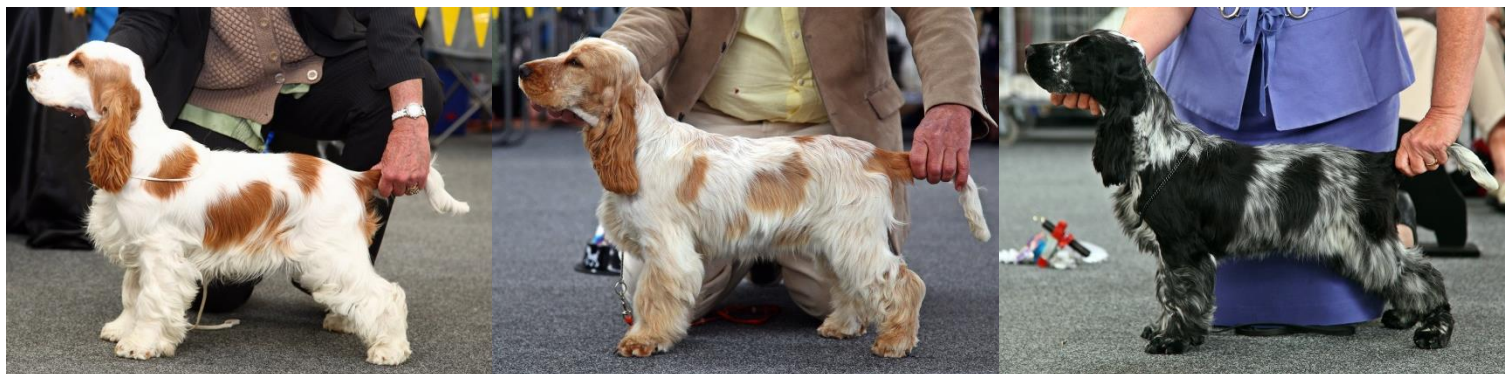
1. Royoni Look What Arrived Royoni Kennel

I really found the baby puppy classes not easy as at 4 months heads are at different stages with some still displaying baby teeth or no teeth some confident some reluctant, all still developing. Positives, bites all looked good and no exhibit displayed shyness. As they mature many will change places but it was dog on the day.