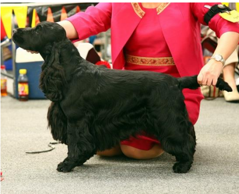
2. - Gr Ch Britebay Bush Tucker Man. Britebay Kennel

Another top quality black dog headed this class of mature solids. Super head, dark eye and lovely expression. Excels in the forehand with clean shoulders, a strong bodied big ribbed short coupled dog. Short below the hock allowing for driving action. Object lesson in black presentation. Efficient professional handling.