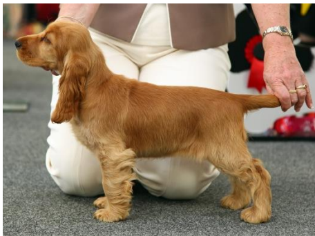
2. - Sunlore Safron Gold J Tobler

(Opposite Minor Puppy in Show) Upstanding five and a half month old golden bitch. Lovely head, well off for bone with excellent front assembly. Hope she doesn't grow on too much. Moved well.